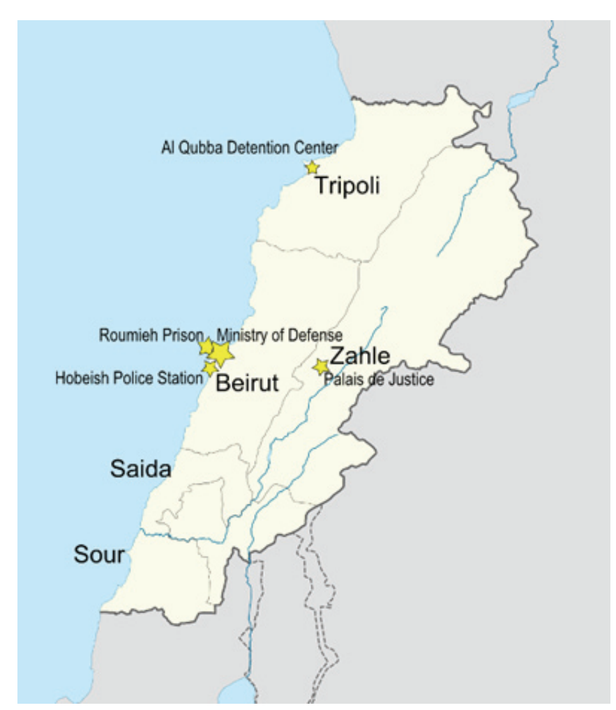
Map 1. Location of main detention and interrogation centres where torture occurs

Annex C has been provided to show the practice of torture occurs throughout Lebanon. Detention centres and police stations are the most common places where torture and ill-treatment are practiced in Lebanon. Such centres are widespread in the capital, Beirut, northern Lebanon and the Bekaa valley<sup>39</sup>. The main centres are set out in more detail below, but in summary Annexes A -C include reported cases in inter alia Tyre (Sour), Anjar, Beirut (Ba'abda and Hobeish), Zgharta and Tripoli Bekaa valley,and under the jurisdiction of inter alia the Judicial Police (Dabita al Adliyya), State Security (Amn al-Dawlah), the police, and Military Intelligence (Mukhabarat al-Askariyya).